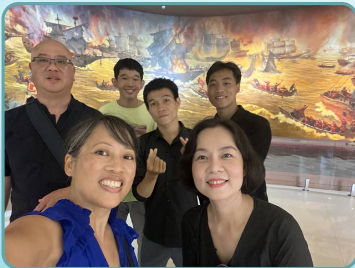
A trip to the museum in Quy Nhon