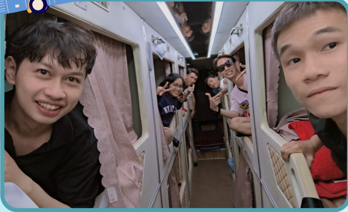
Overnight bus from HCMC to Phu Yen