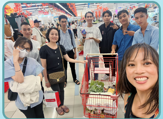
A trip to the grocery store can be a team building activity (HCMC)