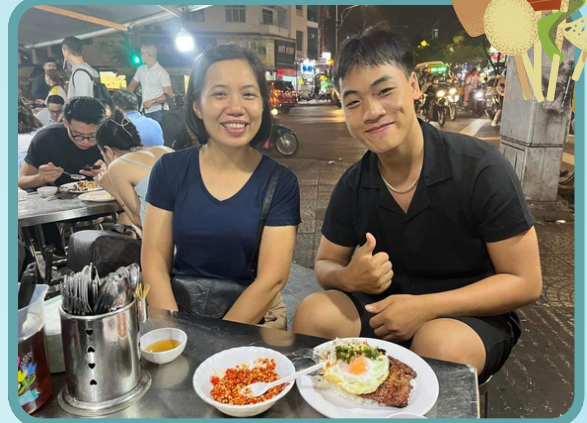
Bonding over street food in HCMC