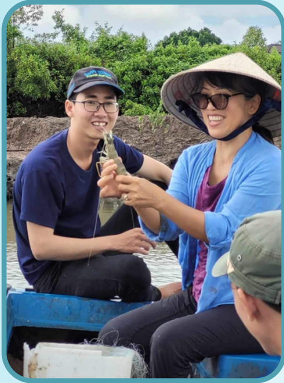
Son (left) graduated with a 3 year degree in logistics